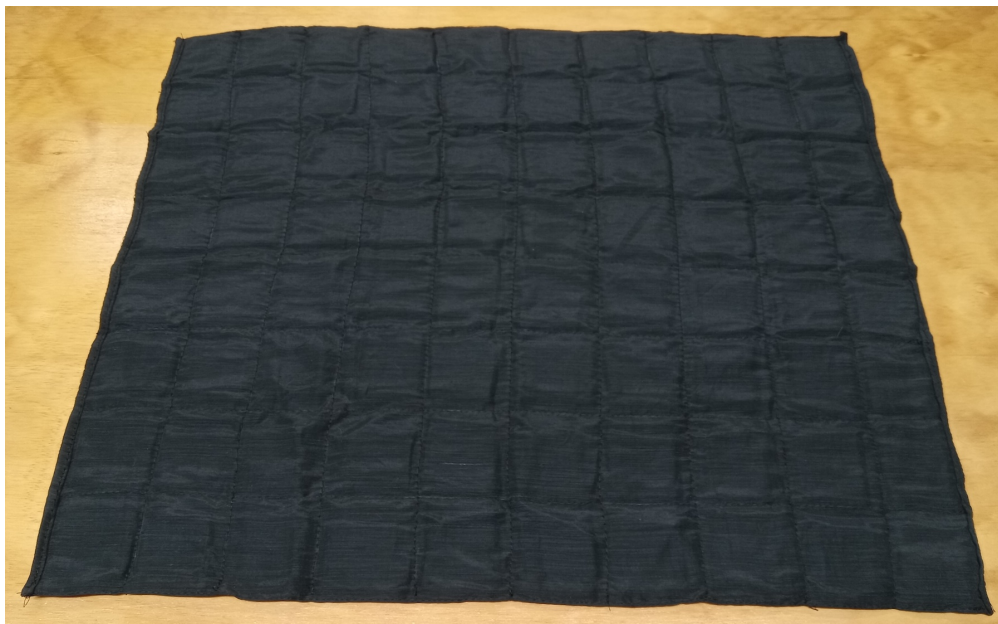
C-Square Blanket 24" X 30" comes with slip cover. Covers entire torso.

Dale Pond 921 Santa Fe Avenue La Junta, Colorado 81050 719-569-0918